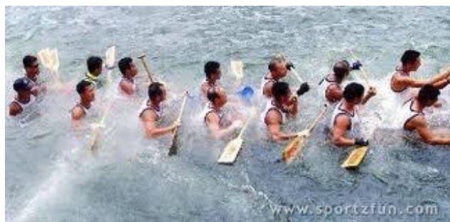
The crew decided maybe it was time to lay off the pies...